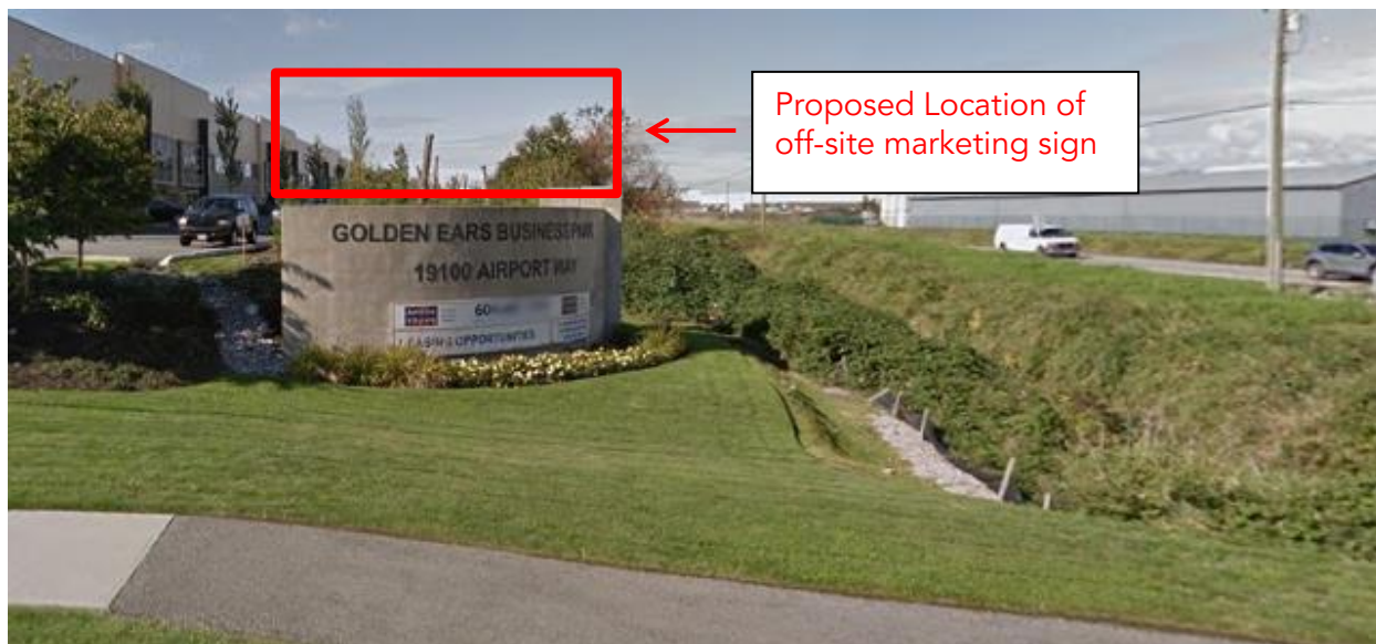
Figure 1: Proposed Location of Off-Site Marketing Sign

Onni Group and, therefore, does not require written consent of the owner of the property on which the sign is located.