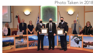
Photo Taken in 2018