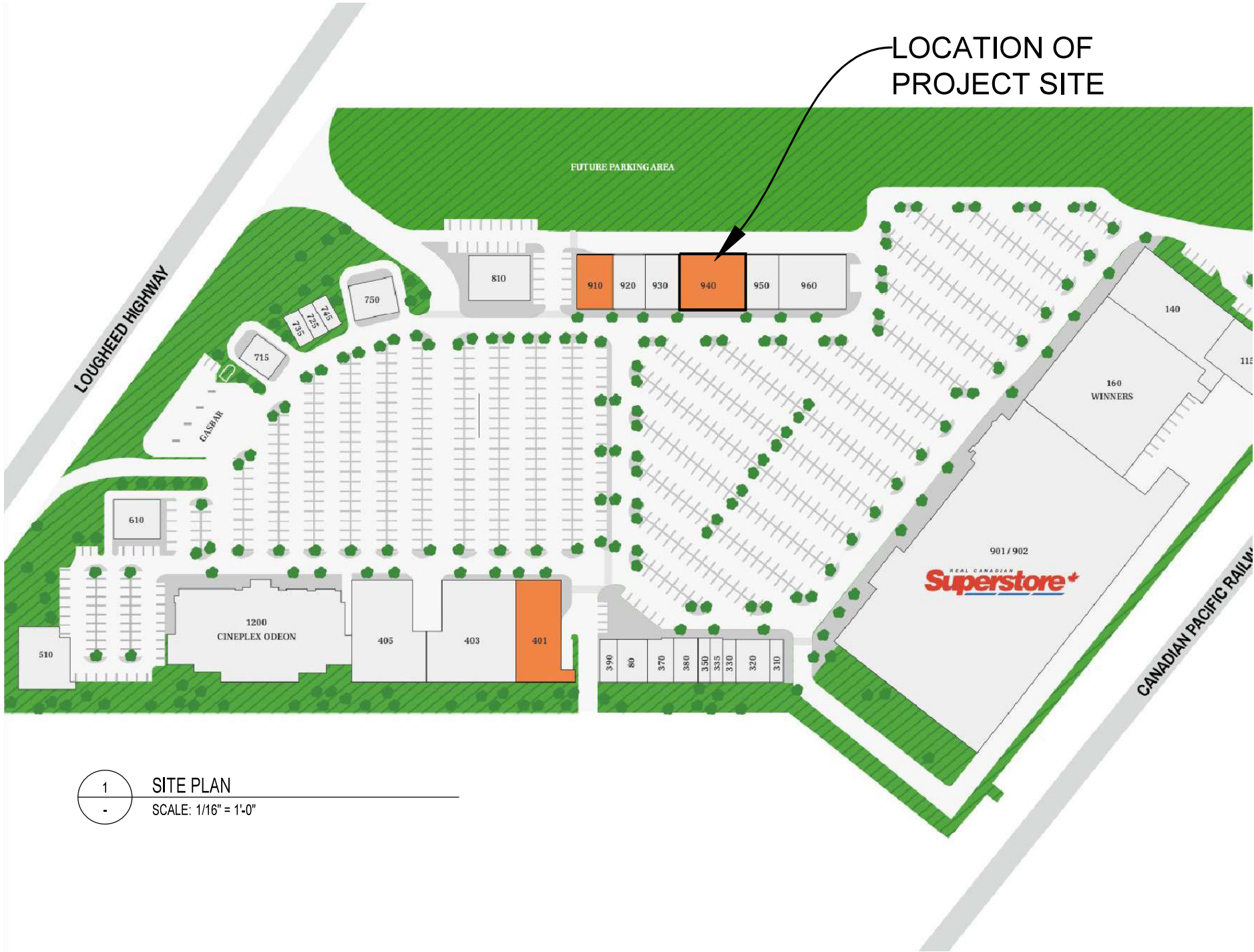
1 SITE PLAN SCALE: 1/16" = 1'-0"